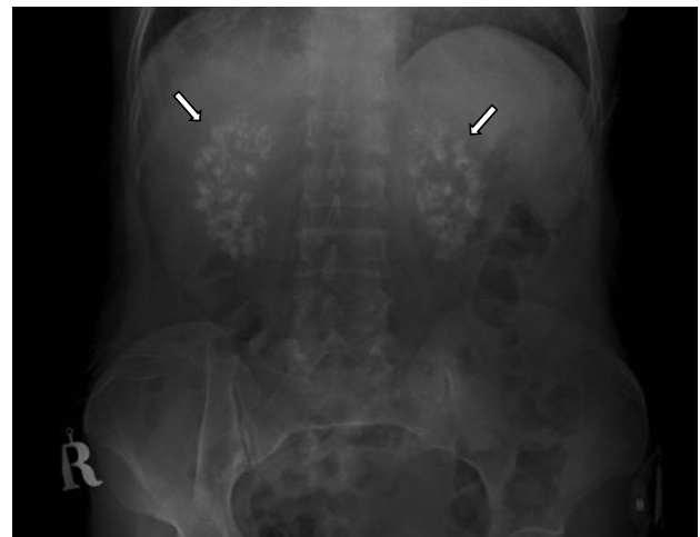
Figure 2: X-ray kidney, ureter, bladder (KUB) shows bilateral nephrocalcinosis (arrows).