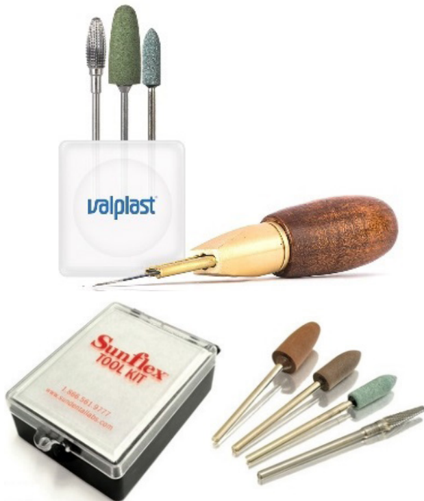
Figure 2: Polishing kits for the flexible denture prostheses