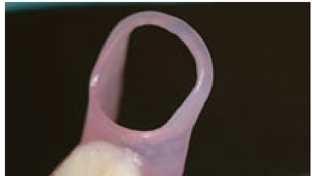
Figure 4: The circumferential clasp