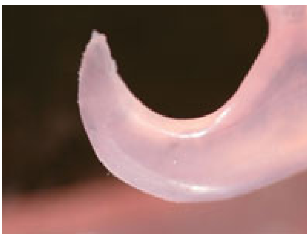
Figure 3: The standard/ main clasp