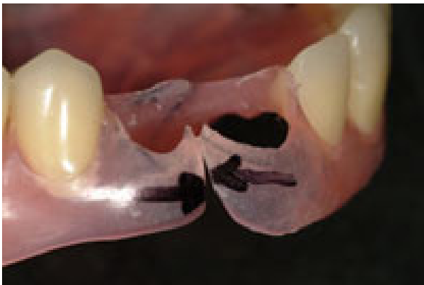
Figure 8: The “separated” clasps