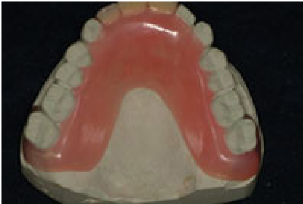
Figure 7: Reach around clasp