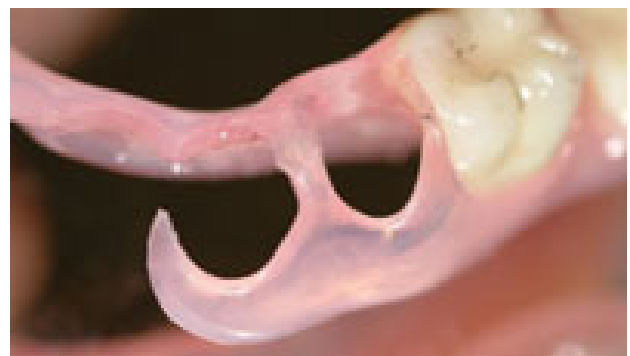
Figure 6: The combination clasp