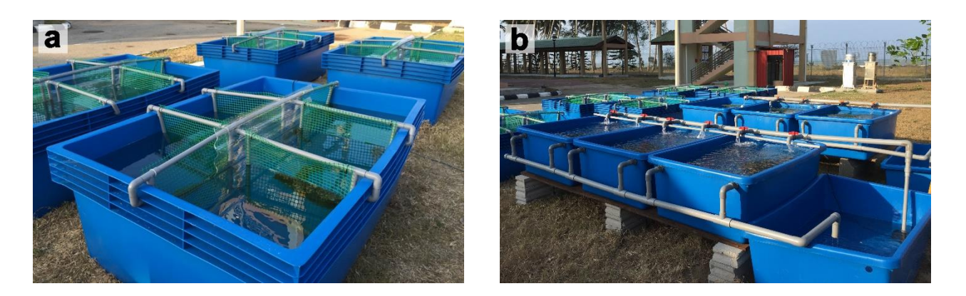
Figure 1. The on-shore farming system (ONS) a) Recirculating system and b) Overflow system

homes. The off-shore system (OFS) comprises two floating platforms (25 m^2 each) with a net in the centre and used to launch floating monolines, providing a farming area of 100 \text{ m}^2 (Figure 2). This OFS is located about 700 m from shore. Kappaphycus alvarezii and Gracilaria will be planted using the monolines while Ulva will be planted in the nets. Local villagers will be involved in the cultivation of the seaweeds, as a technology transfer and community engagement activity. If successful, the trainees will serve as mentors for other villagers to embark on this new income-generating enterprise.