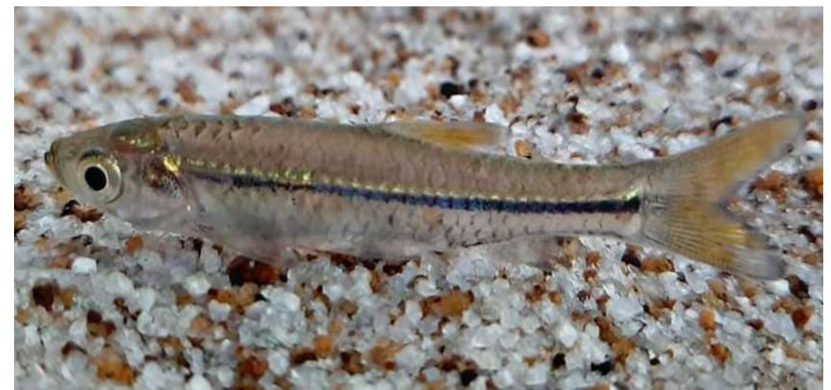
Figure 3. A live specimen of Rasbora baliensis collected from the Solo River, Central Java.

The natural distribution of cyprinids in Indonesia is in the western Indonesia archipelago such as Sumatra, Borneo, Java, and the small islands around it; whereas, the Wallace area (Lombok, Sumbawa, Sumba, Flores, and Timor Island) is not their natural distribution area (Berra, 2001; Lumbantobing, 2014). The presence of non-native freshwater fish beyond their natural distribution is possible due to the introduction by humans for aquaculture or aquarium trade (Hasan et al., 2019c; Insani et al., 2020; Hasan et al., 2020a; Wijayanti et al., 2021; Mangitung et al., 2021: Serdiati et al., 2021). These fishes are released into the rivers or lakes and are then able to adapt to the new environment. Cyprinids are tolerant to new environments (Hasan et al., 2020b), whereby several cases have proven that these fishes are able to reproduce massively in areas that are not their natural habitats such as in South America (Troca et al., 2012; Maiztegui et al., 2019) and Australia (Pinto et al., 2005; Haynes et al., 2009).