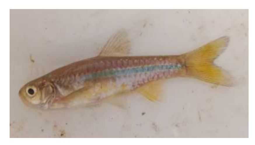
Figure 2. Fresh specimen of Rasbora baliensis collected from Brantas River, East Java.

26-28 in R. baliensis and 29-33 in R. lateristriata ; and (2) the number of scales on the predorsal scales with 11-12 in R. baliensis and 12-14 in R. lateristriata . The coloration of fresh specimen: upper head and body light brown, while the lower jaw and belly are silver; mid-lateral stripe from opercle to caudal base light blue; dorsal, caudal, and anal fins yellowish; and pectoral and ventral fins hyaline (Figure 2 and 3).